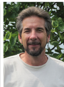
SAM Maintenance Supervisor